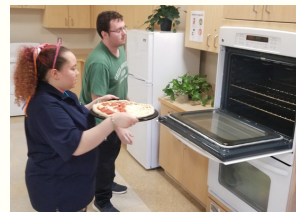
Step 7- Put it in the oven