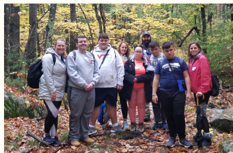
Group Photo from Hiking