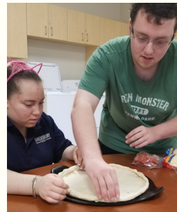
Step 3 - Fold the edges to make crust