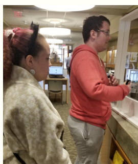
Getting Library Cards