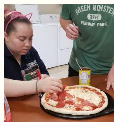
Step 6- Put the pepperoni on