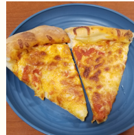
Step 10 - Eat and enjoy!