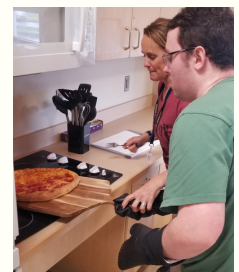
Step 8- Take it out and let it cool