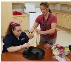
Step 1 - Stretch out the dough and make it flat

Ms Romano taught everyone how to make home made pizza. It was scrumptious!