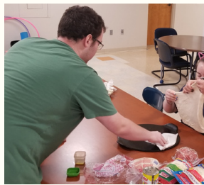
Step 2 - Oil the pizza pan