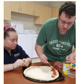
Step 4- Put the sauce on the dough