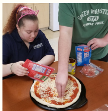
Step 5- Put the cheese on