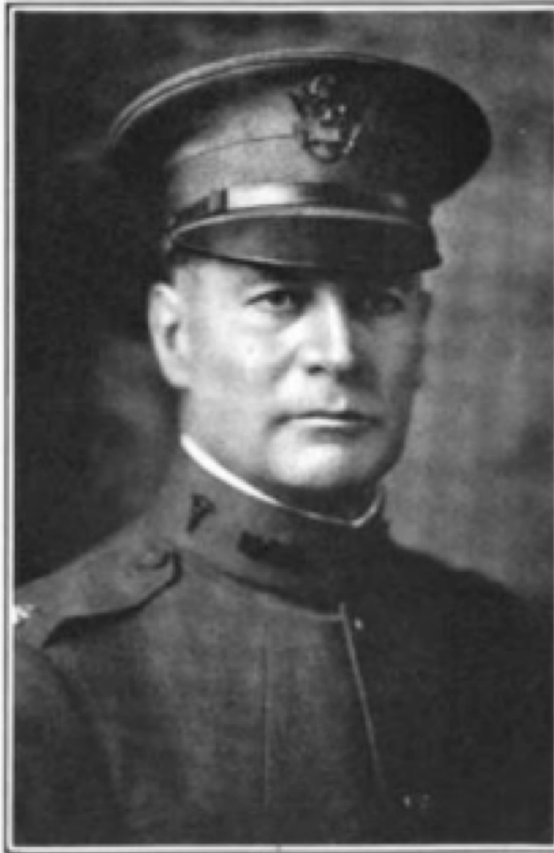
MAJOR HOWARD W. BEAL, '94 Died of wounds, July 20, 1918