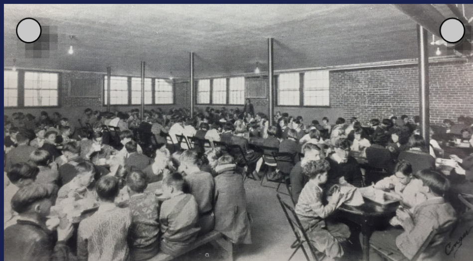
Circa 1920's | View of the Major Howard W. Beal Junior-Senior High School Lunch Room. This space was also utilized as an Art and Mechanical Drawing Classroom.