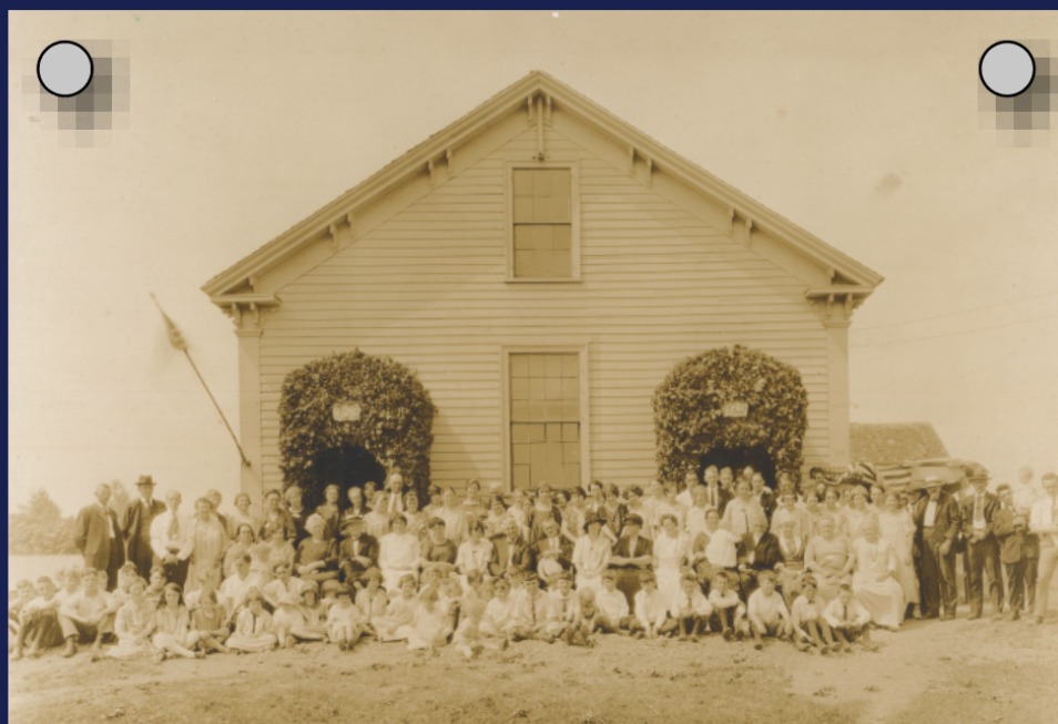
1918 | Reunion photo was taken of former students in front of the No. 7 School. Originally built in 1808 on Crescent Street, the No. 7 School was later relocated to what is now the corner of Route 9 and Lake Street.