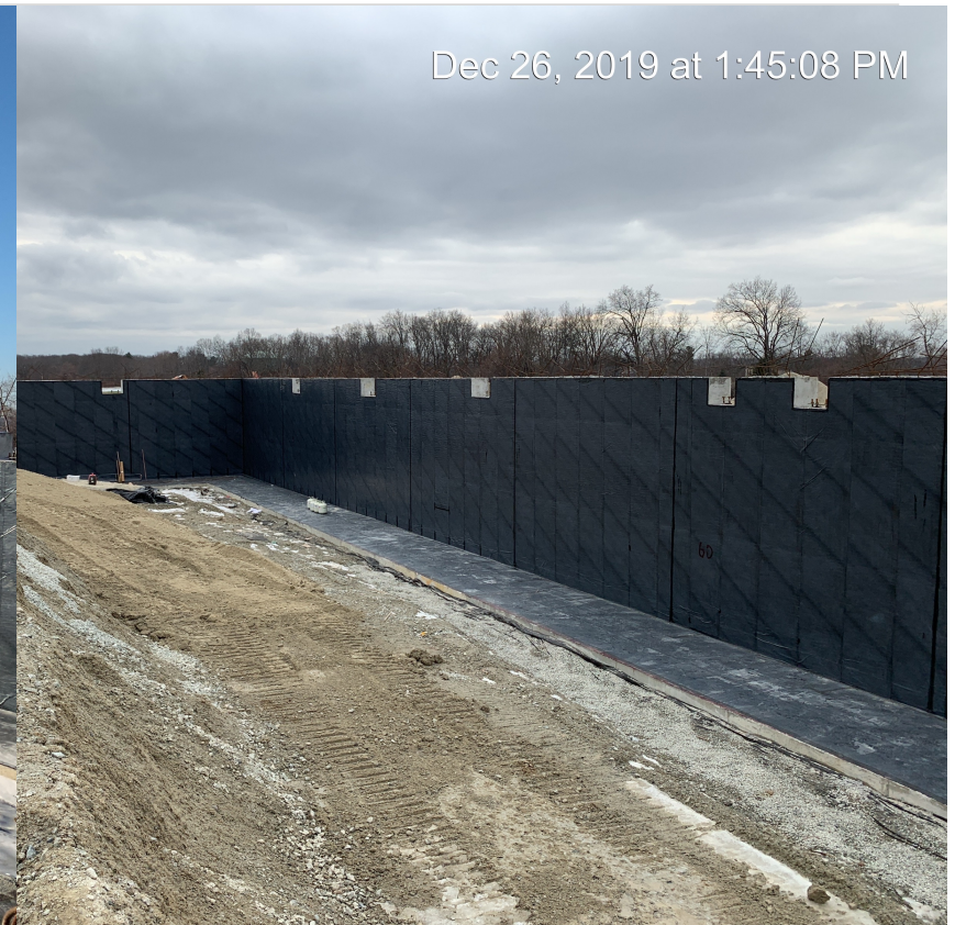
Beal Elementary School Project