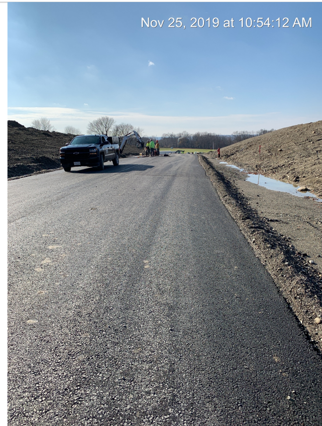
Beal Elementary School Project