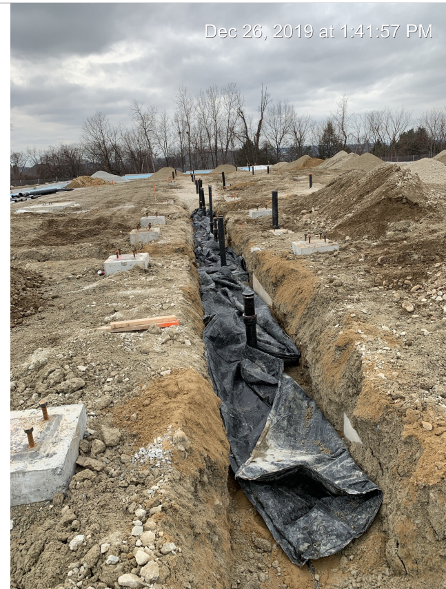
Beal Elementary School Project