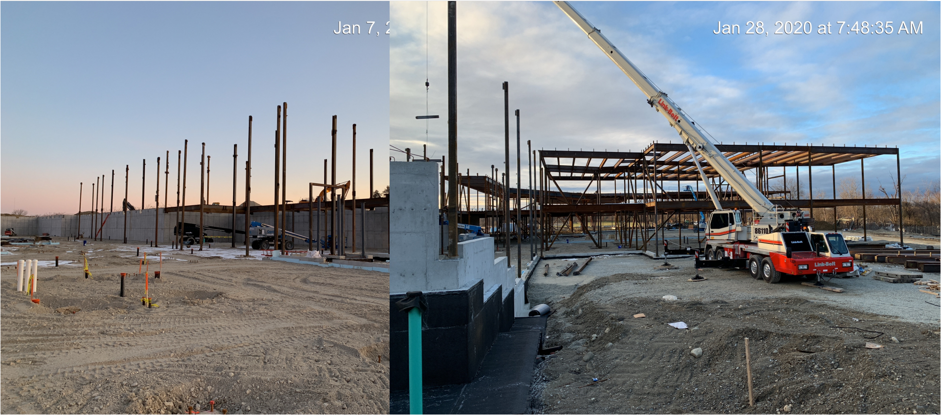
Beal Elementary School Project