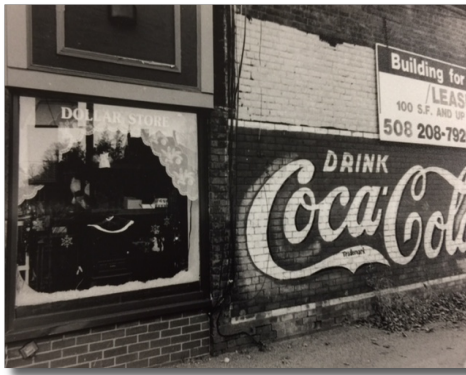
Black and White Photograph taken by student, Ashlee Phaneuf ~ Grade 12

The above images were created by the elementary teachers as visuals to display in their classrooms with the common theme, "Grow Your Brain in Art," and the middle school, teachers use "TAG" as common practice for learning, growing and reflecting.