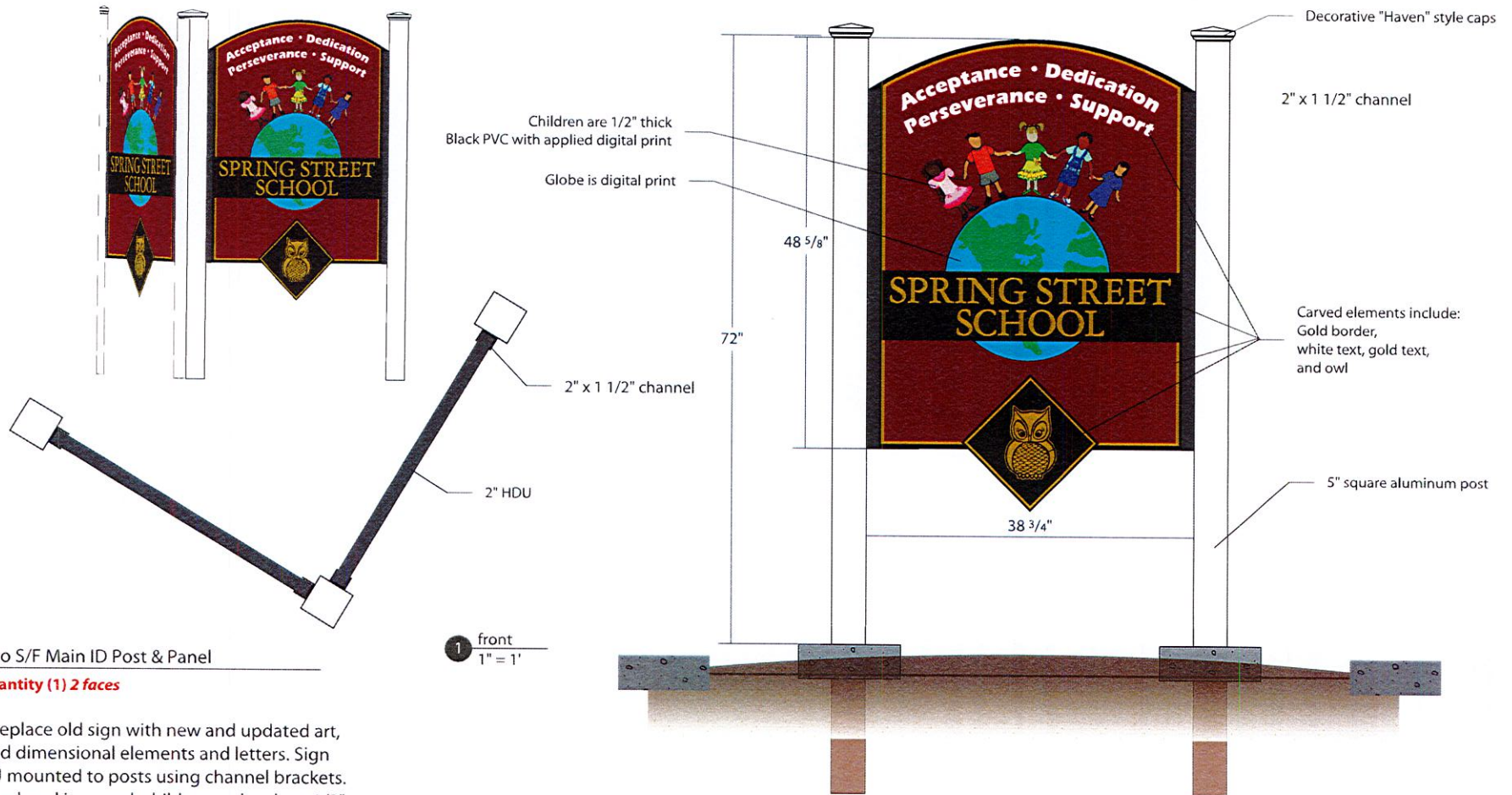
SIGN TYPE A Two S/F Main ID Post & Panel Quantity (1) 2 faces

Recreate and replace old sign with new and updated art, fresh paint and dimensional elements and letters. Sign faces are HDU mounted to posts using channel brackets. All text is carved, owl is carved, children and owl are 1/2" thick dimensional elements with children being digital print. Posts are 5" aluminum posts topped with "Haven" style caps. Border is carved.